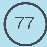
Faculty, Staff, and Professional Mentors