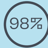
Members in other Campus Organizations