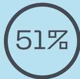
Officers in Other Campus Organizations